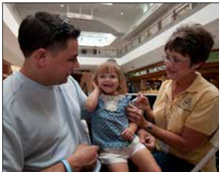
Williamson County and Cities Health District partner with BWI.

Be Wise — Immunize: In a call to action, TMA launched Be Wise — Immunize SM (BWI) in October 2004 to improve Texas' ranking as 41st in the nation for childhood immunizations among 19- to 35-month olds. Since then, more than 218,000 shots have been provided thanks to the diverse partnerships created in hundreds of communities that carry out BWI to ensure their population is more fully immunized.