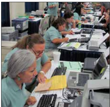
Metro Health, San Antonio's Public Health Team, Immunization Division partners with Be Wise — Immunize.

In 2011, Texas youth received 27,054 shots at events and clinics led by medicine in partnership with schools, community health fairs, health departments, hospitals and others. These were held in