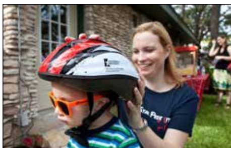
A volunteer ensures the helmet fits properly to ensure maximum protection from head injury.

25 areas of the state including five counties that had not ever held a BWI event. Primary strategies to increase statewide immunization rates to 90 percent are communication, education, and action.