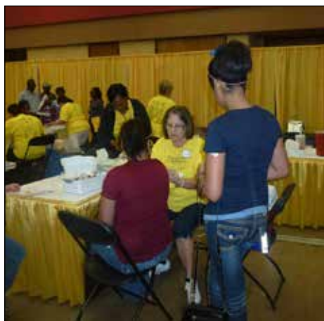
Tarrant County Back to School Round-Up

Healthy Kids Initiative by University of Texas At Houston/ TMA Student Chapter: An eight-week program at the DePelchin's Children Center in Houston enables youth to live a healthier lifestyle. Children who are between foster homes or have been removed from an unsafe home benefit from lectures covering nutrition, making healthy choices and eating patterns, calorie balance, and participating in making a healthy meal. Additional lectures cover health topics such as preventable diseases (cardiovascular, hypertension, cancer and osteoporosis), tobacco/alcohol cessation/prevention, and benefits of increasing physical activity.