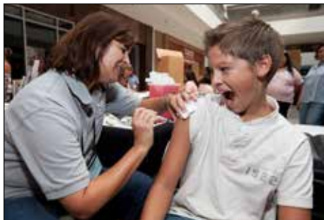
Adolescents are protected through the Be Wise—Immunize program too.

25 areas of the state including five counties that had not ever held a BWI event. Primary strategies to increase statewide immunization rates to 90 percent are communication, education, and action.