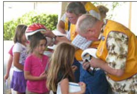
Lions Club volunteers partner with Hard Hats for Little Heads.

partnership with banks, restaurants, insurance companies, civic clubs and many others. TMA physicians educate parents and their children about the importance of wearing a helmet when bicycling, inline skating, skateboarding, or riding a scooter.